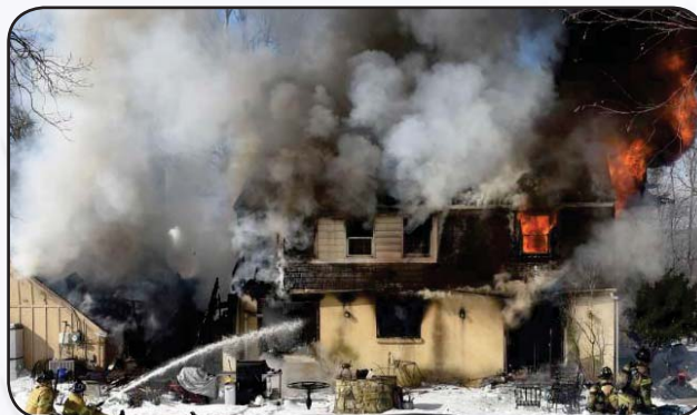
A house was consumed by flames on Greene Road in Tredyffrin this past year. Fortunately no residents or first responders were injured.